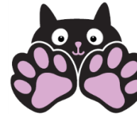
Jerrie Cat's 'paws'