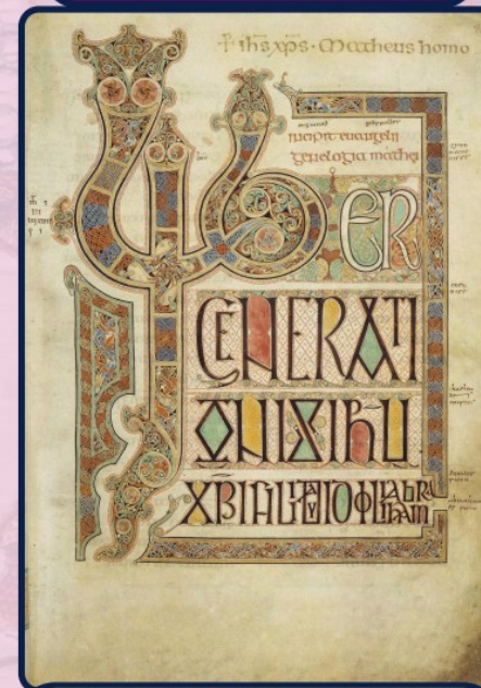
illuminated letter from The Lindisfarne Gospels