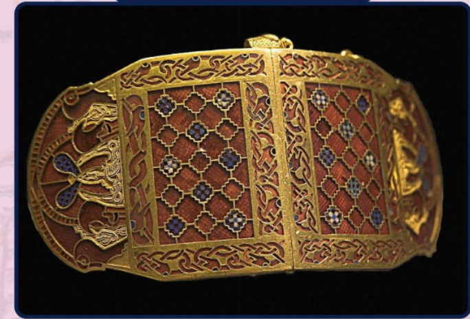
shoulder clasp found at Sutton Hoo