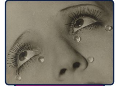
Glass Tears (1932)