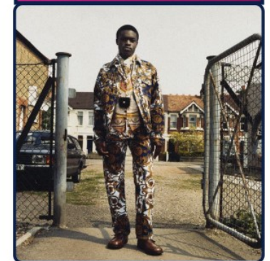
[no title] 1991