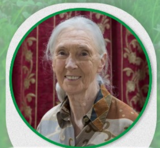
Dame Jane Goodall

a primatologist and world expert on chimpanzees