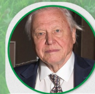
Sir David Attenborough