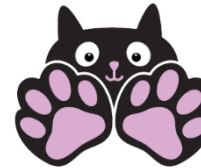
Jerrie Cat's 'paws'