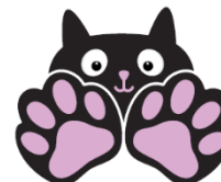
Terrie Cat's 'paws'